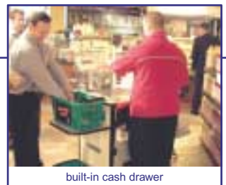
built-in cash drawer